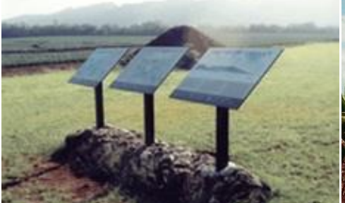
FLaShback ... 09.30.Y2K ... The Hawaiian Civic Club of Wahiawā and The Friends of Kūkaniloko kūpuna presented he hoʻokupu hula ʻili ʻili on the makahalau at the Dedication of three newly installed Interpretive Signs.

Haumāna presented he hoʻokupu hula ʻiliʻili no Kūkaniloko. Hula noho brought to mind our HCCW event September 30, 2000, of the Dedication of 3 Interpretive Signs made by DLNR, State of Hawaiʻi. Our HCCW Kūpuna presented ka hula noho ʻiliʻili...eō