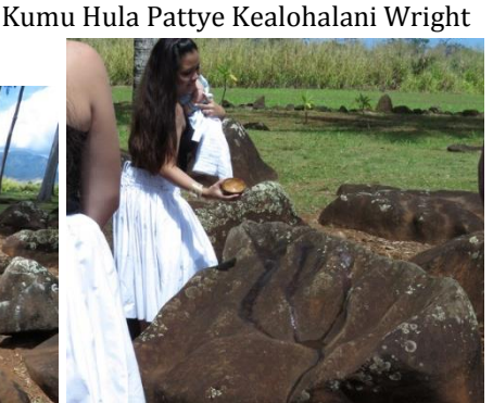
Sharing wai, the most precious gift